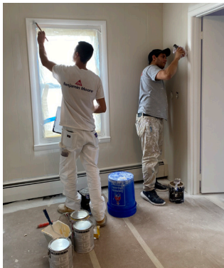
Old paneling gets a fresh coat of paint to make it new again.

St. Gianna's has been leasing a beautiful three-story former rectory from the diocese of Manchester since its opening in 2019. Since the third floor of the home had not been used in many years, it needed a total makeover for much-needed additional bedroom space. Renovation of the third floor is now underway and its completion is slated for sometime late summer. A sprinkler/alarm system, new flooring, bathroom renovation, electrical and plumbing upgrades and painting are nearing completion. This renovation will allow St. Gianna's to fulfill its mission of serving 7 women and their children. A former dream is now a reality due to God's grace and our generous donors!