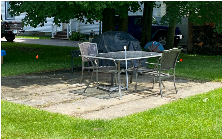
Our current patio will soon be removed and replaced! Stay tuned for the new and improved version!

Our current patio is a sight for sore eyes, not to mention a safety concern. Thanks to our generous donors, we will soon be installing a brand new patio for our mothers and babies to enjoy. It will enhance the beauty of our backyard and the new fence will keep our little ones safe and secure.