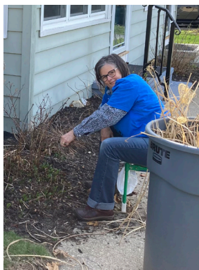
(Clockwise from left) 1-2) St. Matthew of Windham and St. Thomas Aquinas of Derry Youth Groups assembled baby bottles for parish baby bottle campaigns 3-5) St. Matthew Parish volunteers spent a recent morning doing a much needed spring clean up.