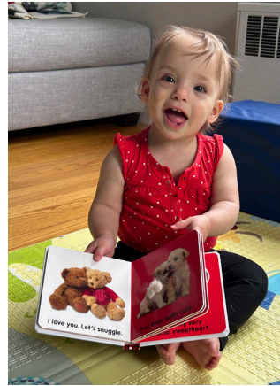
▲ Books are fun!