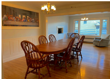
Finished dining room renovation ▼